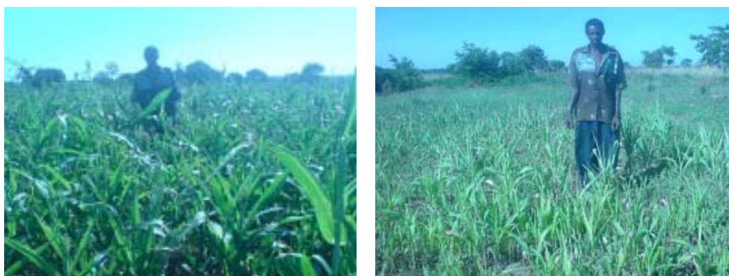
Plate 1. Mycorrhized sorghum (a) and the control (b) in Soroti.