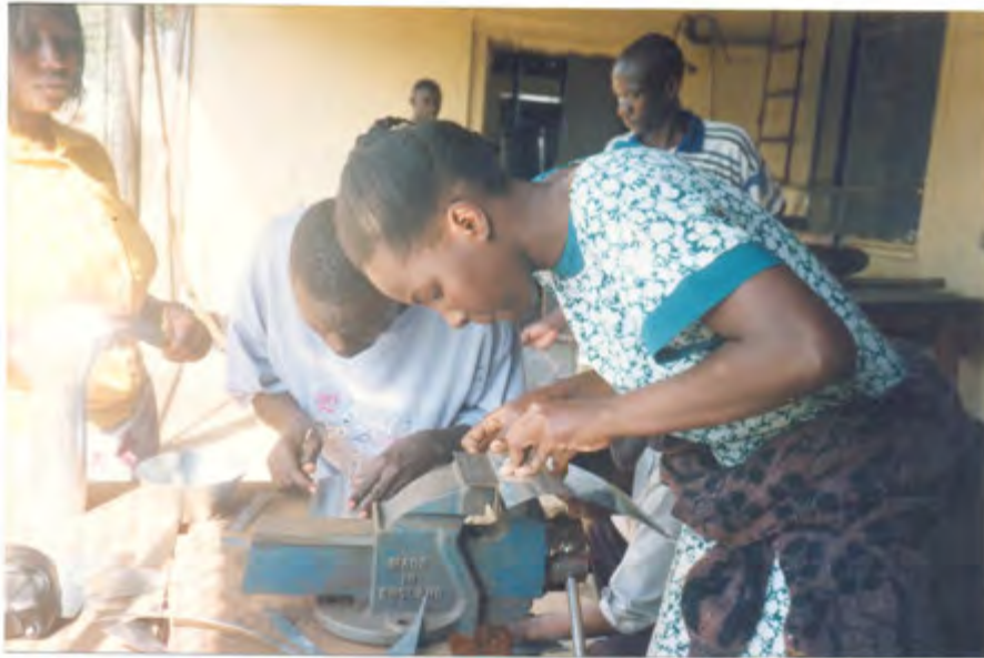
RUFORUM has a deliberate policy to promote training of women scientists and leaders.