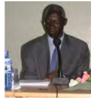
Prof. Livingstone Luboobi

As 2005/06 draws to a close we can look back on a year of considerable success and consolidation. It was a year of success because we were able to put in place the main pillars upon which the Strategic Plan, 2006-2015 and Business Plan 2006-2010, drawn up to address the challenges our people and universities must respond to, rest. The finalisation of these two Plans brought not only a clearer vision of the road map ahead and the target outcomes but also a greater visibility of universities in the development and political arena. Expectedly, it brought also with it greater urgency for us to do more for our people. Already, we have been able to put in place a strong platform for networking not only between and across the member universities, but also with other partners.