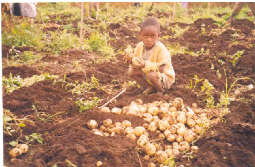
The challenge: This child is not sure of food for tomorrow. Thus RUFORUM support research teams to increase productivity and value addition.