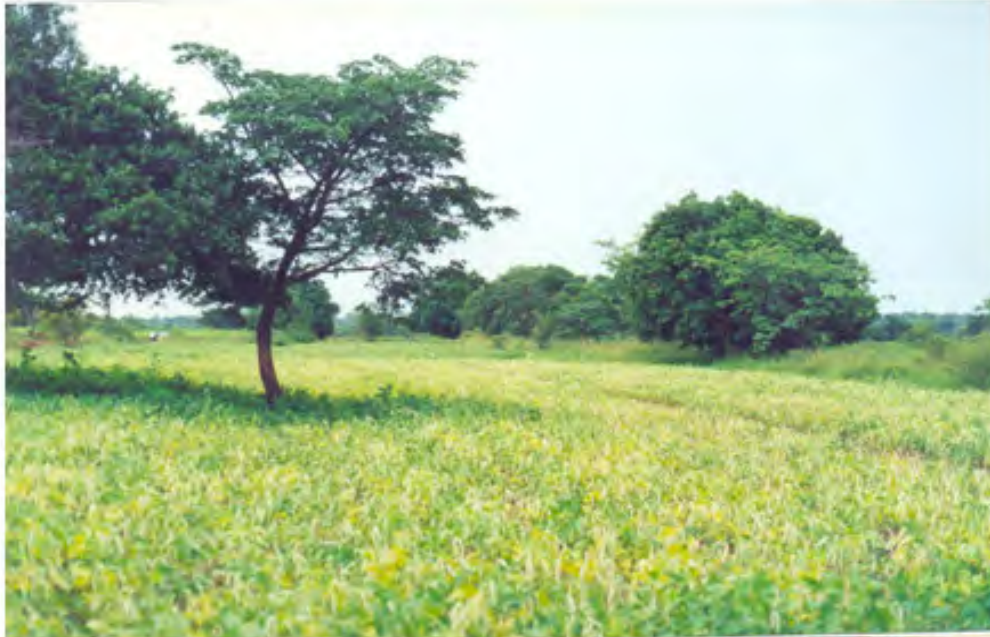
RUFORUM is promoting dissemination of its research technologies. Here, a large field of improved cowpea (MU-93) being grown by a farmer in Kumi, eastern Uganda.

facilitated to attend the 7 th African Crop Science Conference held in Entebbe, Uganda, 5-9 December 2005. The conference provided opportunity for networking the grantees and students from the different universities. Amongst the papers published, 64 were from RUFORUM. Plans are underway to hold the first Regional Biennial Meeting for RUFORUM in mid-April 2007 in Malawi. This meeting will bring together grantees, students and other stakeholders and provide additional platform for evaluating progress being made.