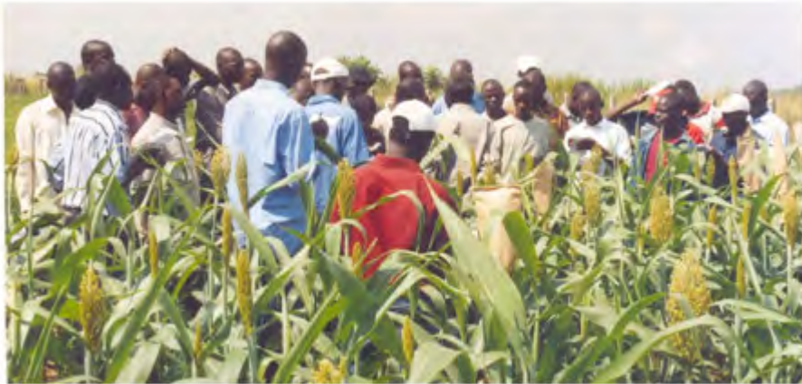
Training the next pool of R&D scientists - students visit field research plots.