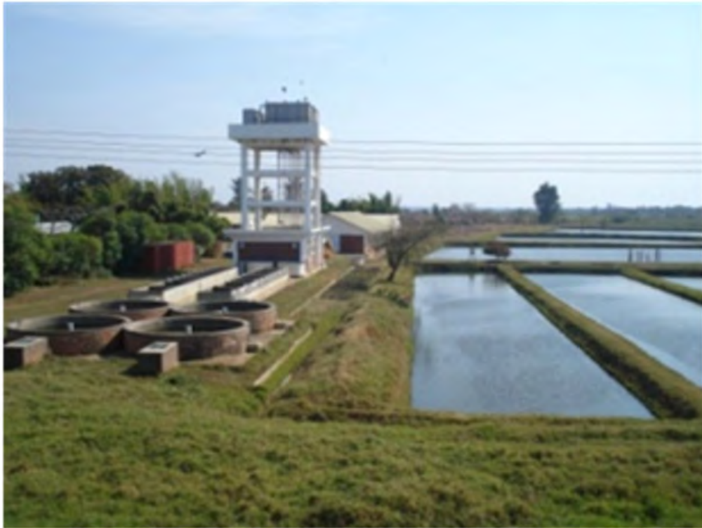
Aquaculture facilities at Bunda College of Agriculture, University of Malawi.