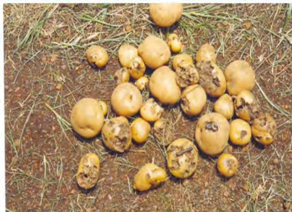
RUFORUM supports research to address constraints to increased productivity, such as reducing damage by pests

Twenty new grants awarded and 40 new Masters Students enrolled: This was implemented in the 2005 training (against an initial target of 60) in the different universities and the first batch is due to graduate later this year. Additionally, 6 Masters and 6 PhD students are being trained under a sandwich arrangement with two USA universities, The Ohio State and Michigan State Universities. More students will be supported during the 2006/07 financial year. The challenge is how to promote more participation of women scientists and students, and provide more grants to universities.