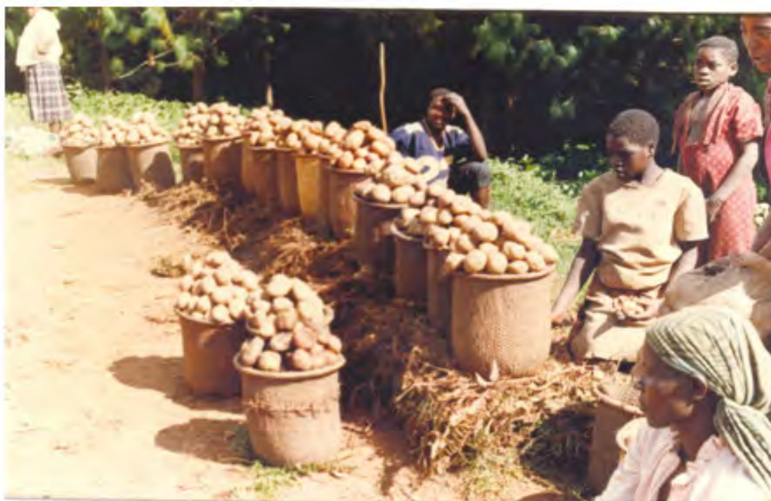
Selling produce at a roadside market in East Africa.