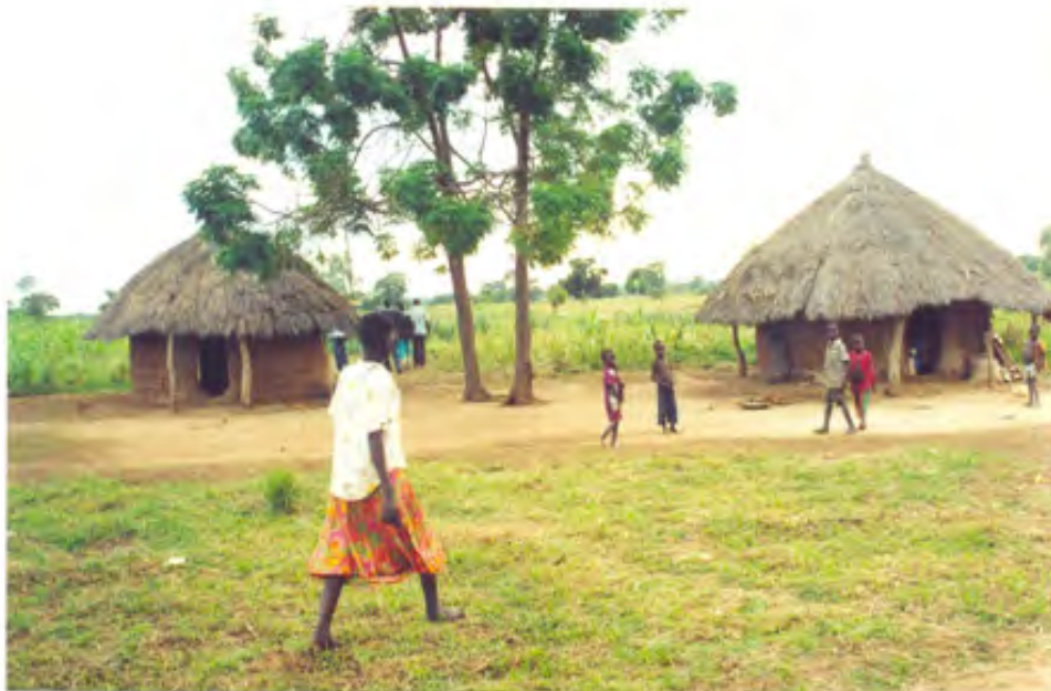
RUFORUM research efforts target poor households, such as the one above in eastern Uganda.