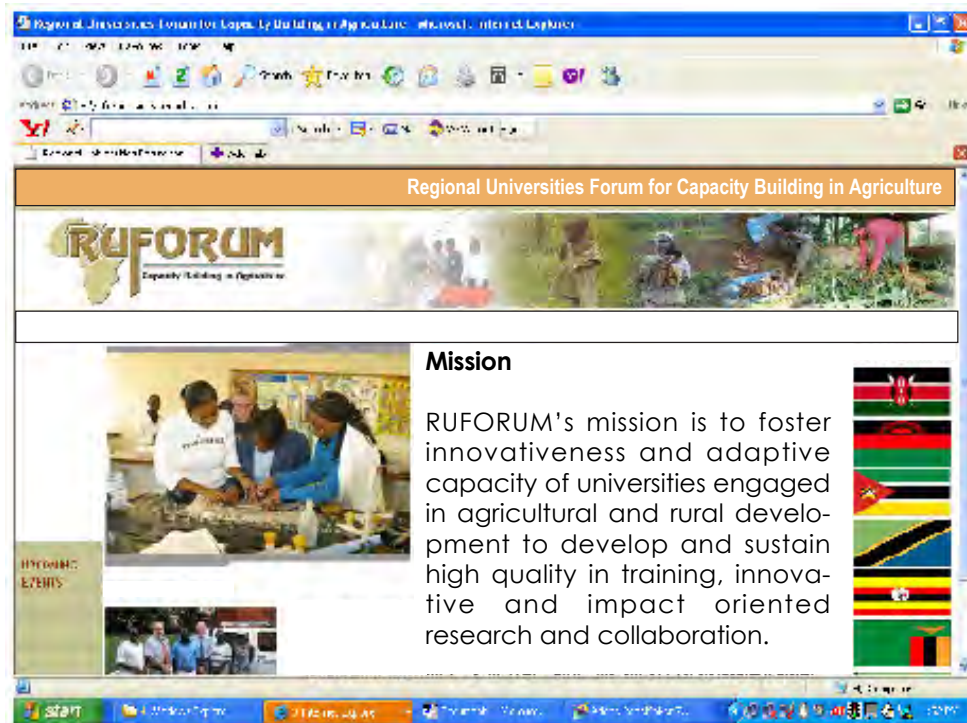
A screen dump for RUFORUM's homepage