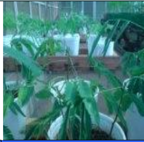
Plate 1: Calliandra in potted greenhouse experiment