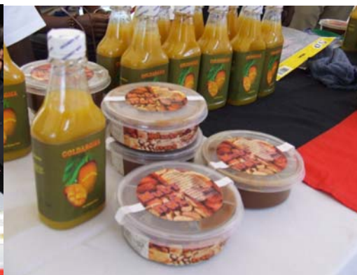
Left: His Excellency President Yoweri Kaguta Museveni at the closing ceremony Right: products from the faculty

At the closing ceremony of the 20 th year anniversary celebrations for the Department, President Yoweri Museveni, who was the Chief Guest agreed to serve as Patron of the Incubation centre and pledged government support to the activity. Following the President's pledge, the Department was invited to submit a proposal for support to the Ministry of Finance, Planning and Economic Development. The Department submitted a proposal requesting financial support of US$ 2.4m to the Department and establishment of venture