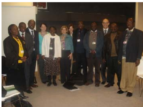
Meeting of ACCKN members with The Terrestrial Carbon Group (TCG)

U.S. President Obama said that countries could show the world their achievements. On the capacity building side universities have a key role to play in backing any further actions in international negotiations, adaptation and mitigation measures, policy formulation, technology development and training.