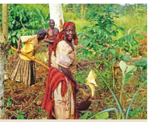
Farmers in Eastern Uganda

I enrolled for the masters in climate and society programme at Mekelle University in Ethiopia. The programme improved my understanding of