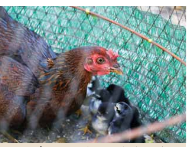
Safe from predators: mother hen and chicks under the semi-scavenging system

research aimed at improving the performance of indigenous chickens through improved feeding and management. Since the majority of farmers allowed their chickens to scavenge freely, the birds did not meet their nutritional requirements for optimal growth and production because scavengeable feed resources were scarce, highly variable and of questionable nutritional value. Therefore, it was prudent to identify local feed resources in the area, determine their chemical composition, formulate diets, and encourage farmers to adopt better management systems of