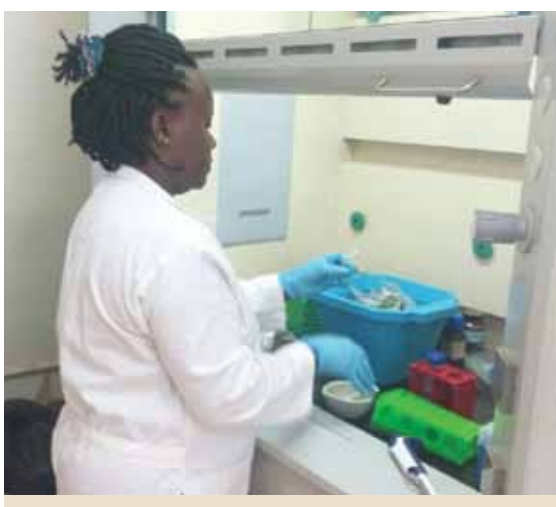
Crossover of fieldwork and lab work

biological stress, leaf size, plant height and market preference were highly ranked at vegetative stage. Also, among commercial farmers, important characteristics for consumers - e.g. leaf colour - were found to be vital, implying that the market strongly influences farmers' selection cues. In terms of taste traits, moderately bitter, tender, and sweet odour were the preferred farmers' cues. This has enabled me to understand what cues inform Nakati vegetable farmers' selection criteria - i.e. their perceptions and preferences