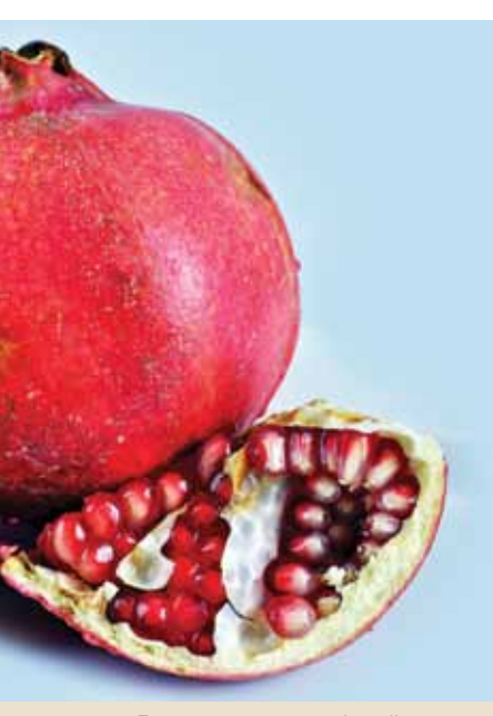
Pomegranate fruit arils

In the interests of overcoming the limitations of conventional modified atmosphere packaging, SARChI Postharvest research in this area has recently extended to a focus on modifying the permeability of the