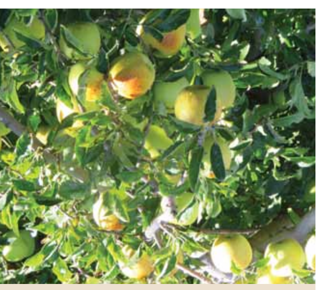
Sunburn browning on Golden Delicious apple in one of the experiment plots of this research at Applethwaite Farm (Pty) Ltd

In 2014, a research team from the Department of Horticultural Science of Stellenbosch University noticed lower sunburn incidence in apple