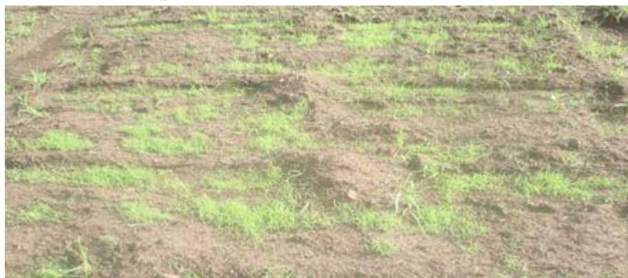
Figure 1. Treatment with tied ridge.